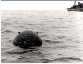
German contact mine in waters off Nova Scotia, 2 June 1943.

The disastrous 1942 season with 21 ships sunk, more damaged and the loss of over 300 lives led Prime Minister Mackenzie King to shut the St. Lawrence Seaway to shipping. Canada's railroads carried the vital war supplies to Sydney and Halifax where they headed off