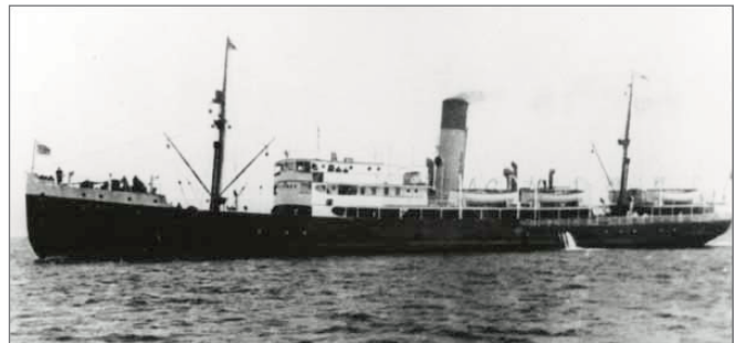
S.S. Caribou