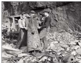
Scotia Pier after Torpedo Attack