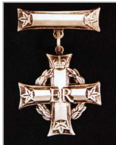
Memorial Cross GRVI