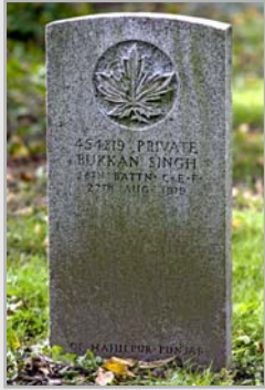
Private Buckam Singh's grave is the only known Sikh Canadian soldiers grave in Canada.